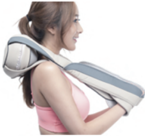
2 Neck massage