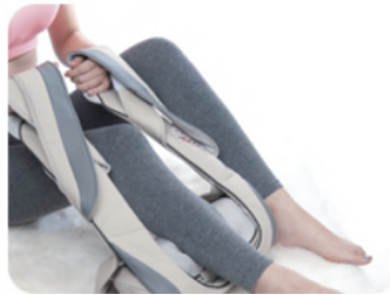
6 Calf massage