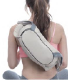
7 Back massage