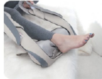
10 Ankle massage