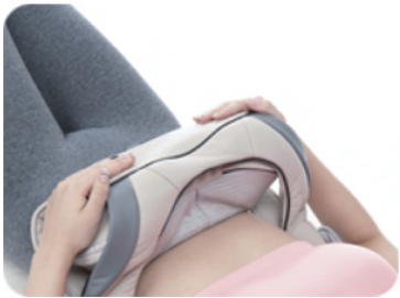
4 Abdomen massage