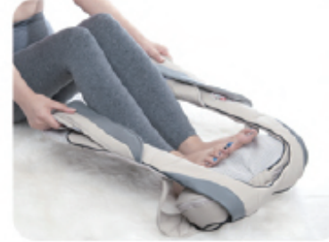
8 Foot massage