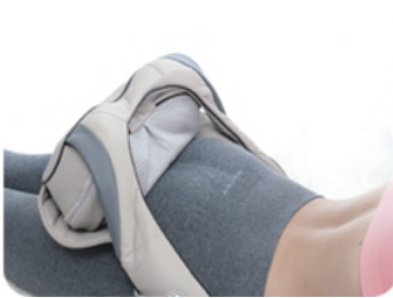
5 Hip massage