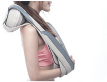
1 Neck and shoulder massage

※ Please refer to the pictures below for a full body massage.