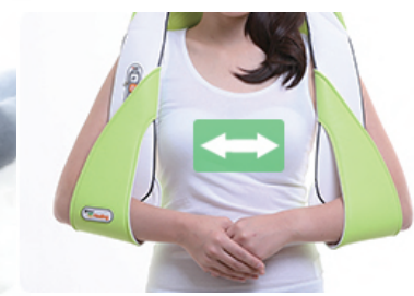
12 Control the massage strength by adjusting the distance between armrests