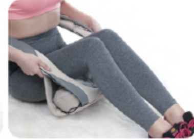
9 Thigh massage